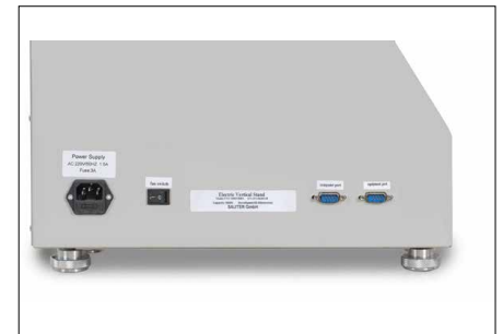
Interface for data transmission from the SAUTER FH measuring device and for controlling the test stand with SAUTER AFH software