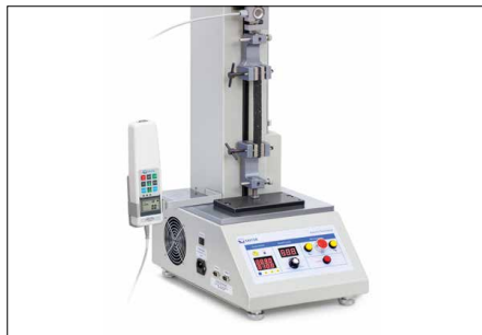
Solid and flexible fixing options for many clamps and accessories from the SAUTER product range, see Accessories