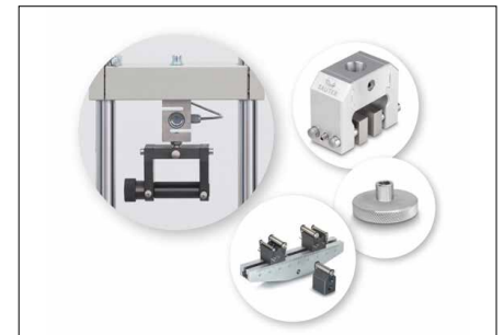
Solid and flexible fixing options for many clamps and accessories from the SAUTER product range, see Accessories