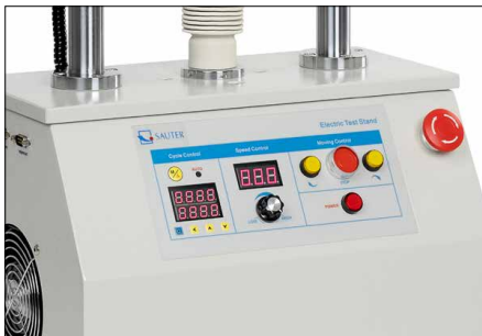
Premium operating panel - Digital speed display - Digital repeat function