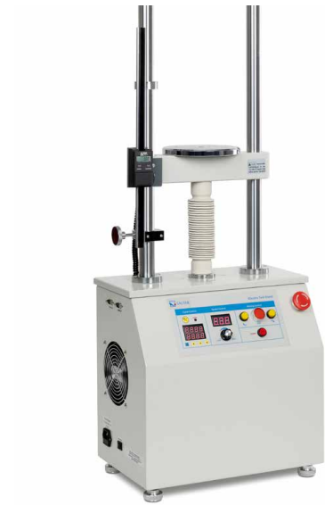
Motorised test stand incl. length measuring device LB