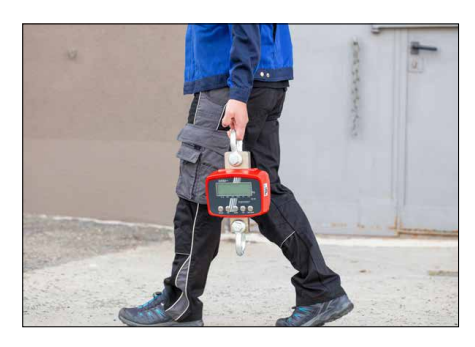
High mobility: thanks to rechargeable battery operation, compact, lightweight construction, it is suitable for the use in several locations (production, warehouse, dispatch department, etc.)