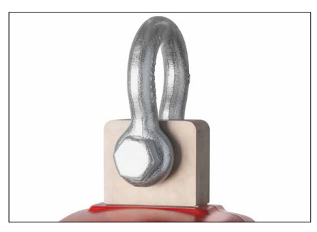
Solid shackles, non-revolving