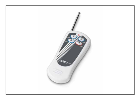
Radio remote control standard. Range up to 20 m. All functions can be selected (excl. ON/OFF). W×D×H 65×24×100 mm. Batteries included, 1×12V, 23A