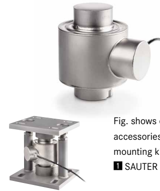
Fig. shows optional accessories, mounting kit ■ SAUTER CE P4136