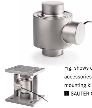
Fig. shows optional accessories, mounting kit ■ SAUTER CE P4136