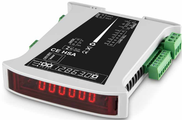
KERN CE HSA