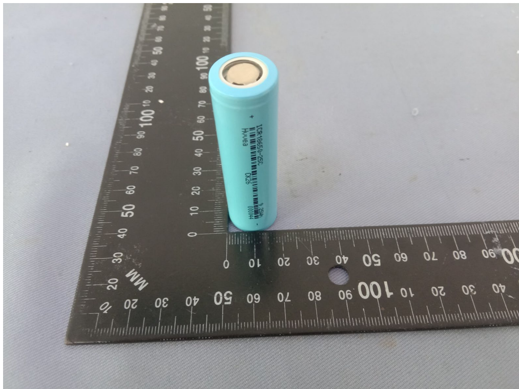
Figure 2 Overall view II of cell (外观图II)